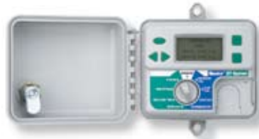
ET System Module

Gathers weather data on site, continuously calculates the ideal program for your landscape