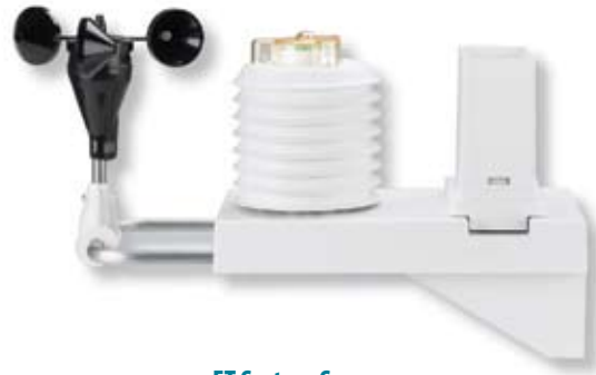
ET System Sensor (Shown with optional ET WIND)

T ake the guesswork out of residential irrigation scheduling, by tracking your local microclimate and automatically calculating a scientific irrigation program! The Hunter ET System is an easy-to-add-on accessory (for any Hunter controller that operates with a SmartPort® system) that measures key climatic conditions, and uses them to calculate your local Evapotranspiration (ET) factor. The ET is then downloaded into your irrigation controller to create an irrigation program that is just right for your sprinkler system, plants, and soil conditions. By taking into account the rate at