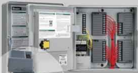
Easy-to-install modules allow you to customize the ICC from 8 to 48 stations.

It's an idea that makes so much sense... while saving you so many dollars. For the professionals who stock and carry controllers, modules make inventory control easy—there's no need to estimate how many of each size controller you need to keep on hand. Now you simply stock modules. And that means, for customers whose systems require a non-standard number of stations, with modules you can customize the controller to the exact needs of the project—even if those needs change as the project grows.