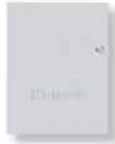
Stainless Steel Cabinet