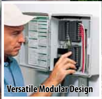
Versatile Modular Design