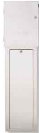
Stainless Steel Pedestal

H unter introduced the concept of personalized construction for controllers—allowing custom tailoring to more effectively handle the odd number of stations a system may require—and the acceptance has been overwhelming. Then again, why shouldn't it be? After all, nothing else makes more sense when seeking the ideal choice to run irrigation systems at virtually any commercial site, from schools, parks, and sports fields to hotels, resorts, and apartment buildings. The idea is a simple one: a controller that's "built" by