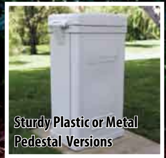
Sturdy Plastic or Metal Pedestal Versions