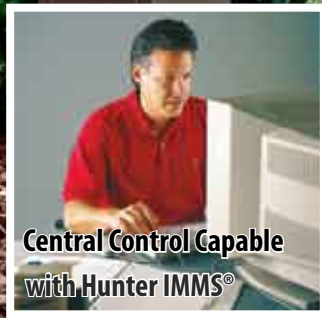
Central Control Capable with Hunter IMMS ®